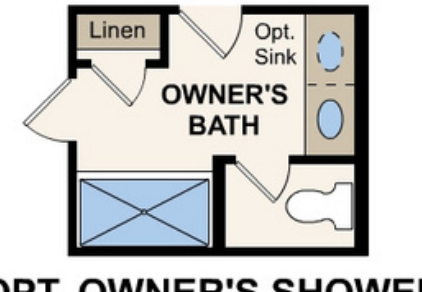
OPT. OWNER'S SHOWER